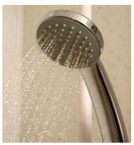
The water debt is estimated to be held across 1.6 million households – at least 12% of California families.