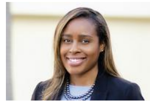
Yasmine-Imani McMorrin Councilmember, City of Culver City