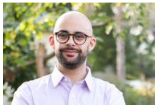
Ronaldo Fierro Councilmember, City of Riverside