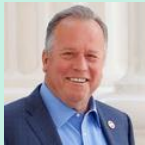
Bill Dodd State Senator Author, SB 852

CivicWell was instrumental in the success of SB 852 by providing timely, professional, knowledgeable, and critical support at each step of the legislative process. Thanks to CivicWell, local governments will now be able to take on their most significant climate challenges.