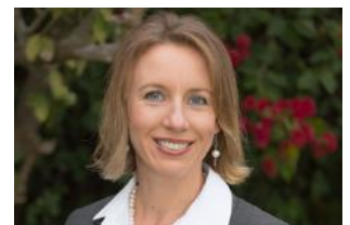
Catherine Blakespear Mayor, City of Encinitas