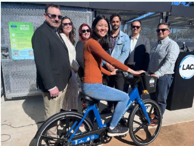
Top: Chula Vista Community Shuttle. Bottom: LACI's Zero Emissions Share Mobility for Rancho San Pedro