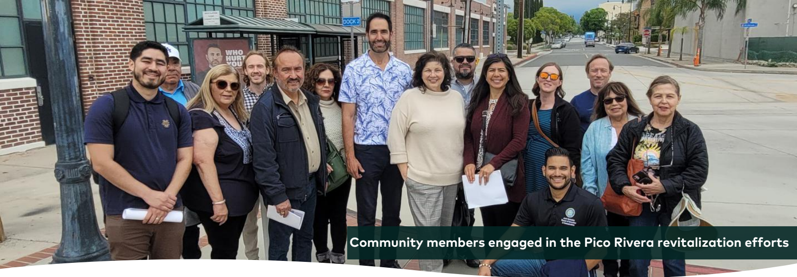
Community members engaged in the Pico Rivera revitalization efforts