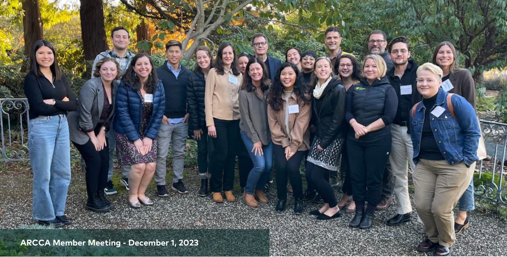
ARCCA Member Meeting - December 1, 2023