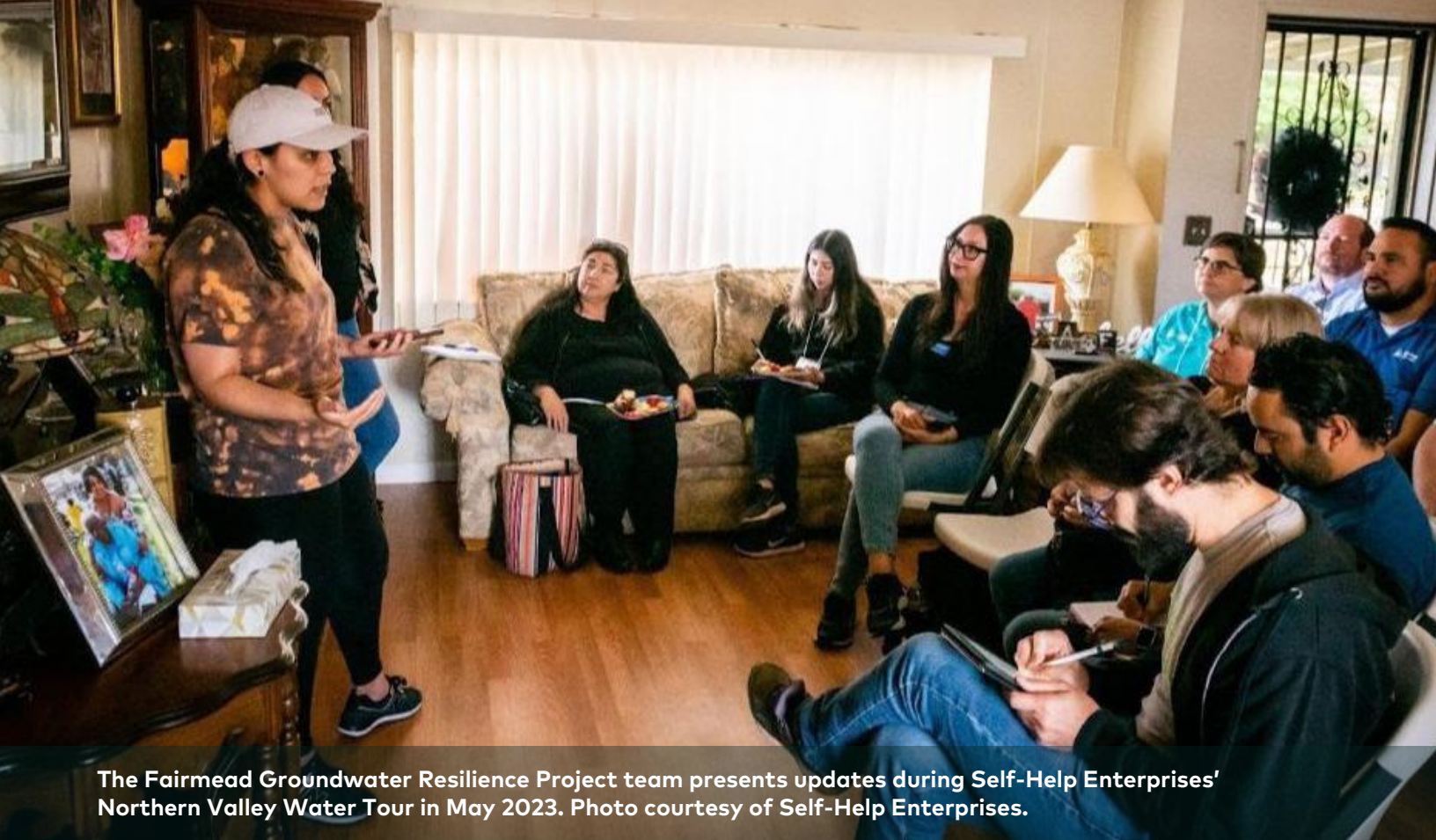
The Fairmead Groundwater Resilience Project team presents updates during Self-Help Enterprises' Northern Valley Water Tour in May 2023.