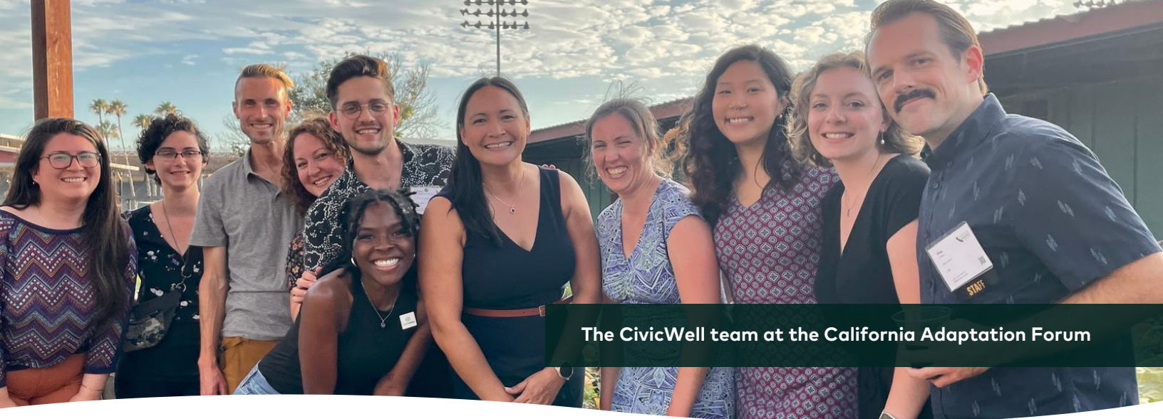
The CivicWell team at the California Adaptation Forum