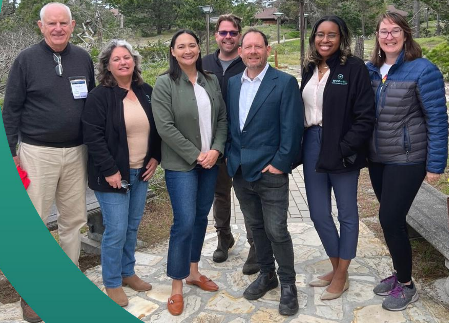
Members of CivicWell's Board at the 2023 CivicWell Polymakers Conference