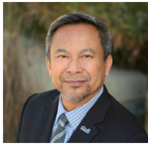
Gabe Quinto Councilmember City of El Cerrito