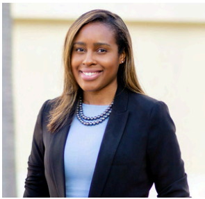
Yasmine-Imani McMorris Councilmember City of Culver City