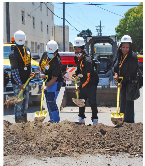
Breaking ground at Pogo Park in Richmond, CA

We strive to provide Strategic Partners with opportunities to build relationships with local elected officials and leaders, deepen your impact, and grow brand recognition in the clean and green economy.