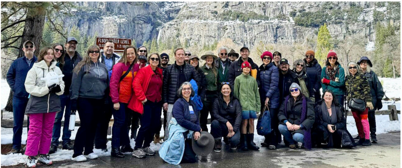
AARP California hosted a Nature Walk at the CivicWell Policymakers Conference in Yosemite